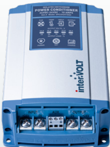
GEN II SPCi – with terminal cover removed.